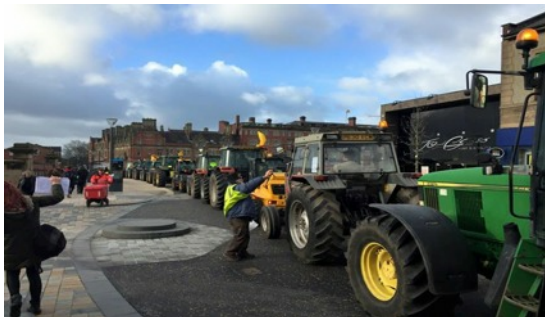
Farmers making their opposition clear at County Hall in January